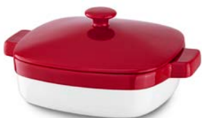
KitchenAid® Ceramic 1.9-Quart Ceramic Casserole Dish with Lid Model No. KBLR19CRER

Purchase a qualifying KitchenAid® Convection Digital Countertop Oven* and receive a FREE KitchenAid® Ceramic 1.9-Quart Casserole Dish with Lid (a $29.99 value) by mail.